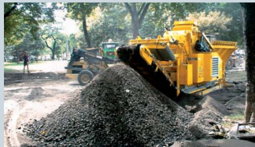
Success factor quality and pure sorting: up to 80 t/h cubic value grain from building debris, asphalt, concrete and in landscape design