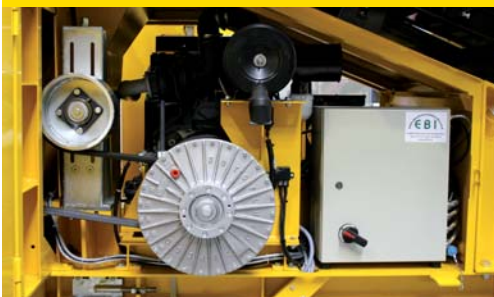
Efficient: automatic 2-step conveying and diesel / electric drive (9 to 12 l)

RUBBLE MASTER Compact Recyclers are the compact class for mobile processing: they are versatile in use, powerful and stable in value. They produce high-quality cubic value grain from construction debris and natural rock on-site and cost effectively. Thanks to their compact dimensions and low weight, they can be transported without any special permits. Proven technology, individual advice and the RM Lifetime Support programme enable the RUBBLE MASTER user to offer affordable, mobile recycling and establish a profitable line of business with exceptional quality. Because we are only satisfied when our customers are successful!