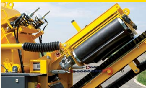
Indispensable: release system to remove blockages, plus reliable magnetic separator