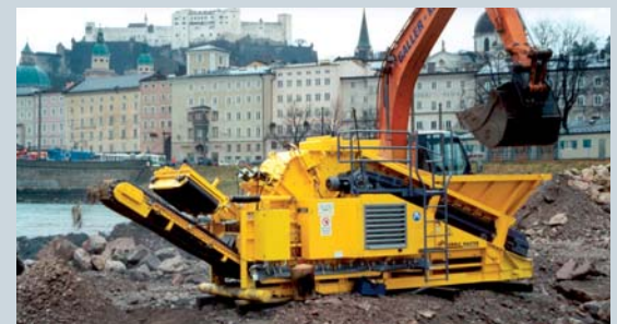
Appreciated by residents: thanks to series dust suppression and noise reducing cover