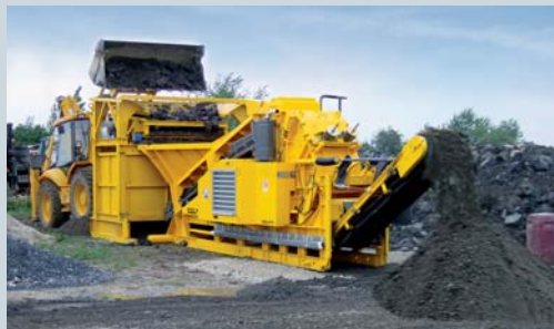
Less wear through pre-screening: the robust VS60 – also available with side conveyor belt – separates fines from the feed material

The impact crusher is easy to operate and all service jobs can be carried out from ground level. With high-performance components such as pre-screens and final screens, you can create a complete recycling centre. The building contractor becomes a service provider for companies and communities, creating clear, cost-efficient recycling loops. RUBBLE MASTER partners offer advice on optimum settings and site logistics on a case-to-case basis.