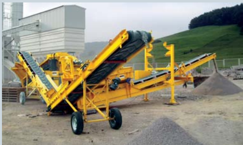
Profitable niches: recycled production waste can be separated in the container-mobile CS2500 and reused to save costs