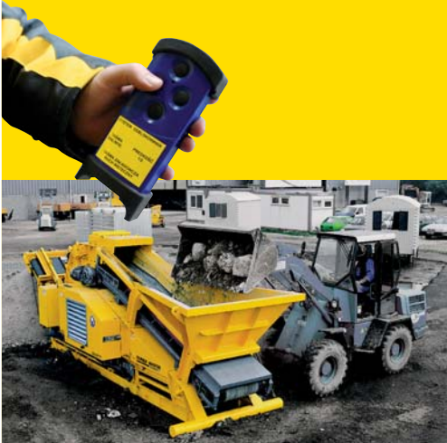
Easy handling: fed with small construction loaders (loading edge 190 cm), remote control optional